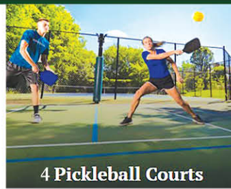
4 Pickleball Courts