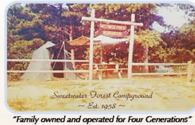
"Family owned and operated for Four Generations"

676 Harwich Road • Brewster, MA 02631 (508) 896-3773 • www.sweetwaterforest.com email: reservations@sweetwaterforest.com