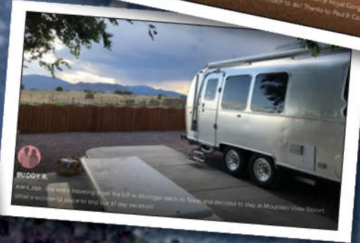
RUDY R. After 2017, we were leaving with the 60 in Michigan back to Texas and decided to stay at Mountain View Resort. What a wonderful place to end our 87 day vacation!