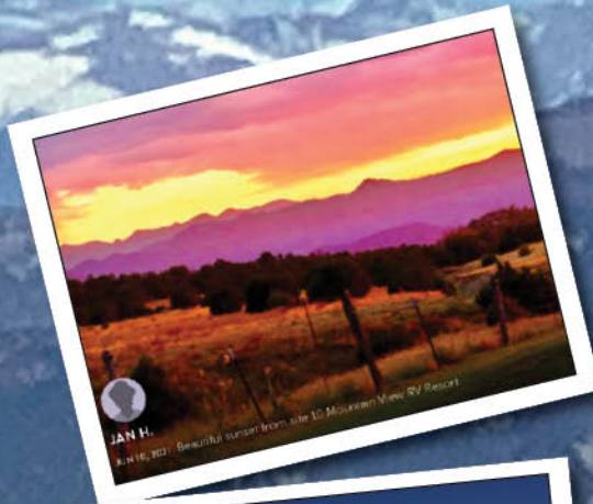
JAN H. 8/11/16, 2017 Beautiful sunset from site 10 Mountain View RV Resort

45606 W. HIGHWAY 50 • CANON CITY, CO 81212 719.275.0900 • WWW.MOUNTAINVIEWRVRESORT.NET MVRRINFO@GMAIL.COM