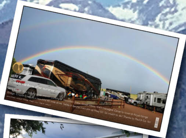
JEFF K. Double rainbow after summer storm 7/14/16, 2017 Bridge Copper Creek a beautiful 40 mile drive. Safety & Service. Great sites. We'll be back. Close to town & Royal Gorge We'll be back. Close to town & Royal Gorge We'll be back. Close to town & Royal Gorge