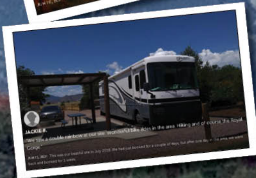
JACKIE B. We saw a double rainbow at our site. Wonderful site. Lots in the area. Hiking and of course the Royal Gorge. 8/11/16, 2017 This was our third stay in July 2016. The host just booked for a couple of days, but after one day in the area, we were back and booked for 3 weeks.