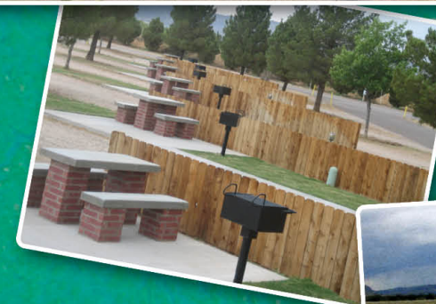
Your Headquarters for the Big Bend & Davis Mountain Areas