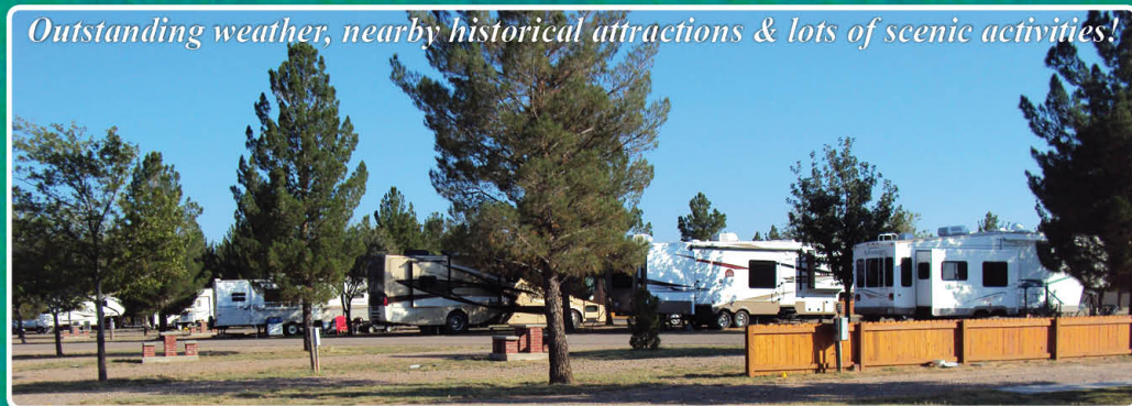
Outstanding weather, nearby historical attractions & lots of scenic activities!