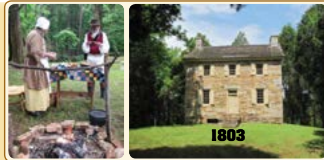
Historic Howser House