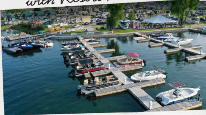
Marina Dock Slips + Boat Rentals!