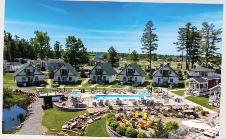
Stunning Waterfront Lodging!