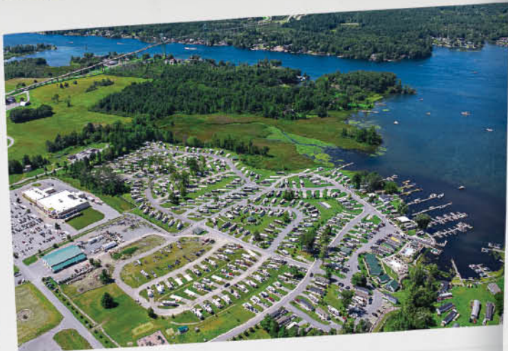
Luxury R.V. Camping with Resort Amenities