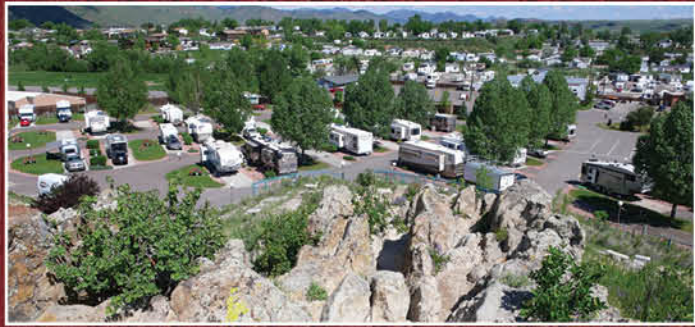
Take a short hike up our nature trail to the top of "Scenic Rock" for a spectacular view of Denver and the Front Range.