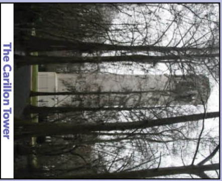
The Carillon Tower