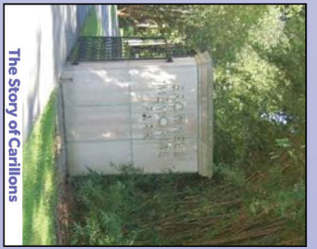
The Story of Carillons