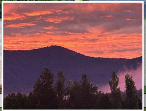
Table Rock Rd.