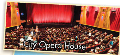
City Opera House