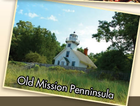
Old Mission Peninsula